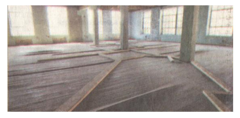
Work has begun (shown above) on 24 single-story condominiums in one of three buildings (above left) at the High Street Lofts, The first phase - 10 three-story town houses in the same building - is complete.

Many others will be middle- to senior-level military and civilian positions who will purchase homes or condo-