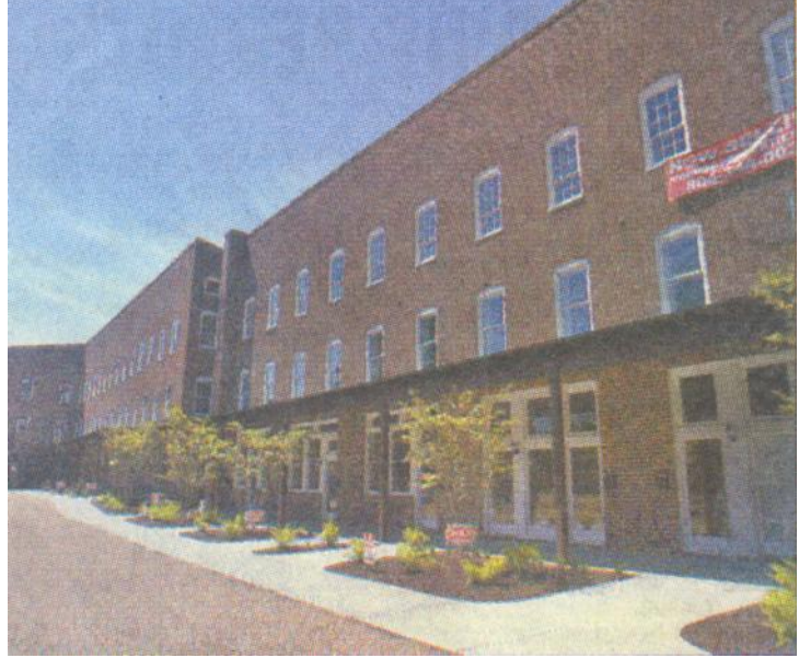
The former Seward Luggage Manufacturing Co. in Petersburg - three attached historic buildings - is being transformed into the High Street Lofts, a condominium complex.

A good shot in the arm not just for Petersburg but the entire region, \ensuremath{\mathbb{M}} orris said.